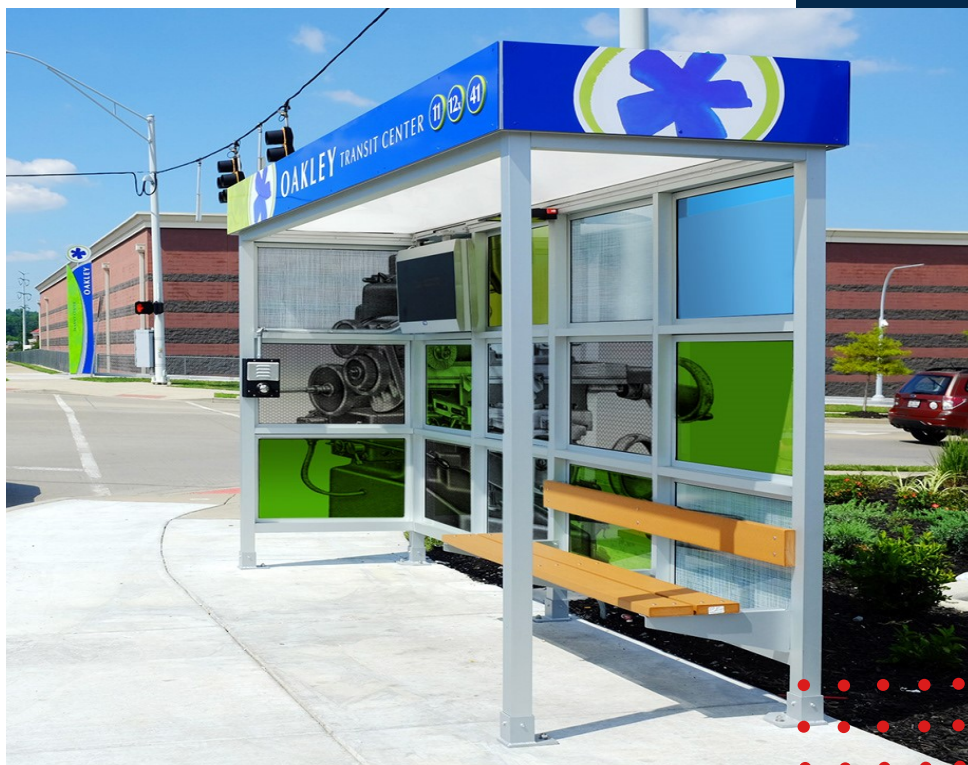
Slimline Dome Shelter with Partial Length Wall Mounted Bench with Cedar HDPE Bench Slats and Backrest.