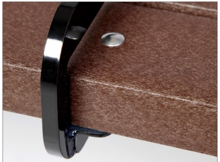
Beam bench with brown HDPE bench slats and Traffic Black powder coat painted frame.

AMERICAN MADE. AMERICAN TRUSTED. SINCE 1993.