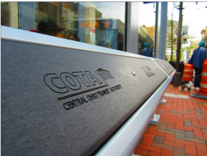
Eclipse HDPE leaning rail with black HDPE slat and white aluminum powder coat painted frame. Custom CNC engraved logo.