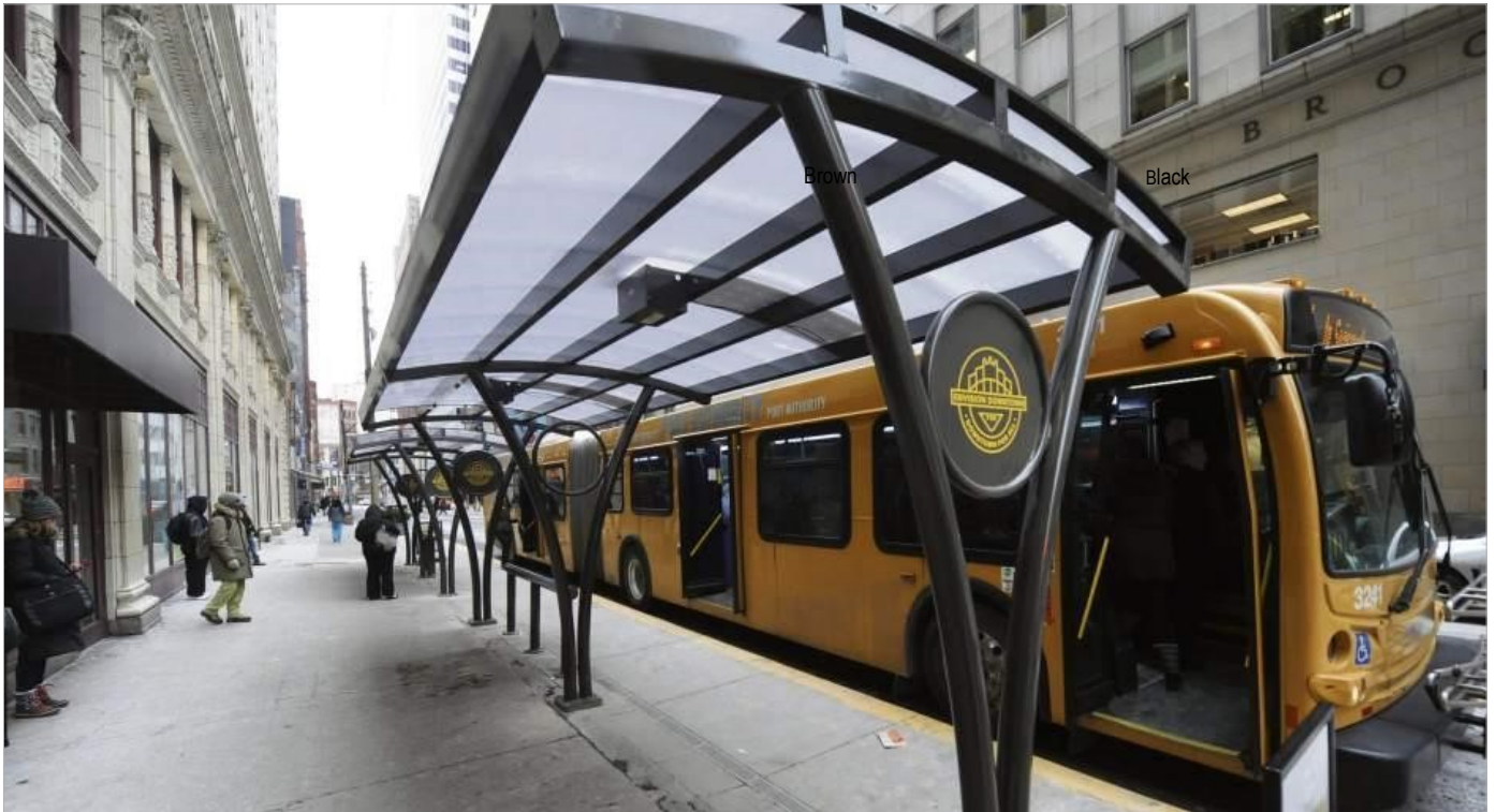
Brasco's Aero Shelter with Clear Structured Polycarbonate Roof Glazing

*additional charges will apply, based on availability